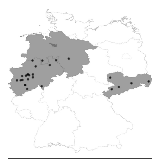
FIGURE 3 Study Sites—26 Train Stations in Three German States

Note : The study sites were located across three German states ( Bundesländer ) in the former East and West. Information regarding each station, including the name of the stations, as well as other miscellaneous details are included in the SI Appendix.