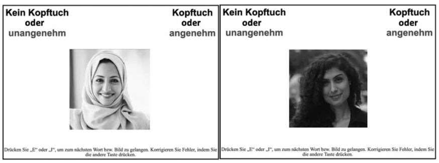
FIGURE 6 The Implicit Association Test (IAT) in Practice Kein Kopftuch Kein Kopftuch K

Note : A screen capture of the IAT. We used eight pictures each for the immigrant with hijab and the immigrant without hijab categories. The IAT is generated using the R package IATGEN created by Carpenter et al. (2019).