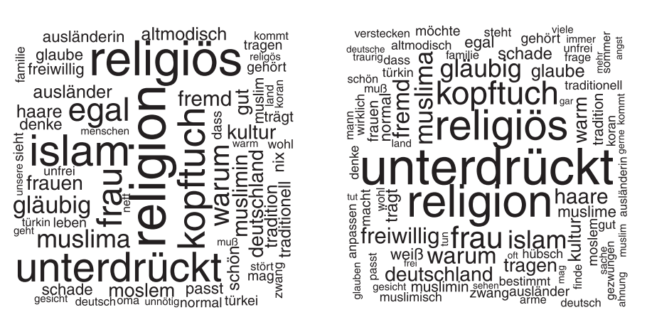
FIGURE 8 Word Cloud of Open-Ended Responses on the Meaning of the Hijab