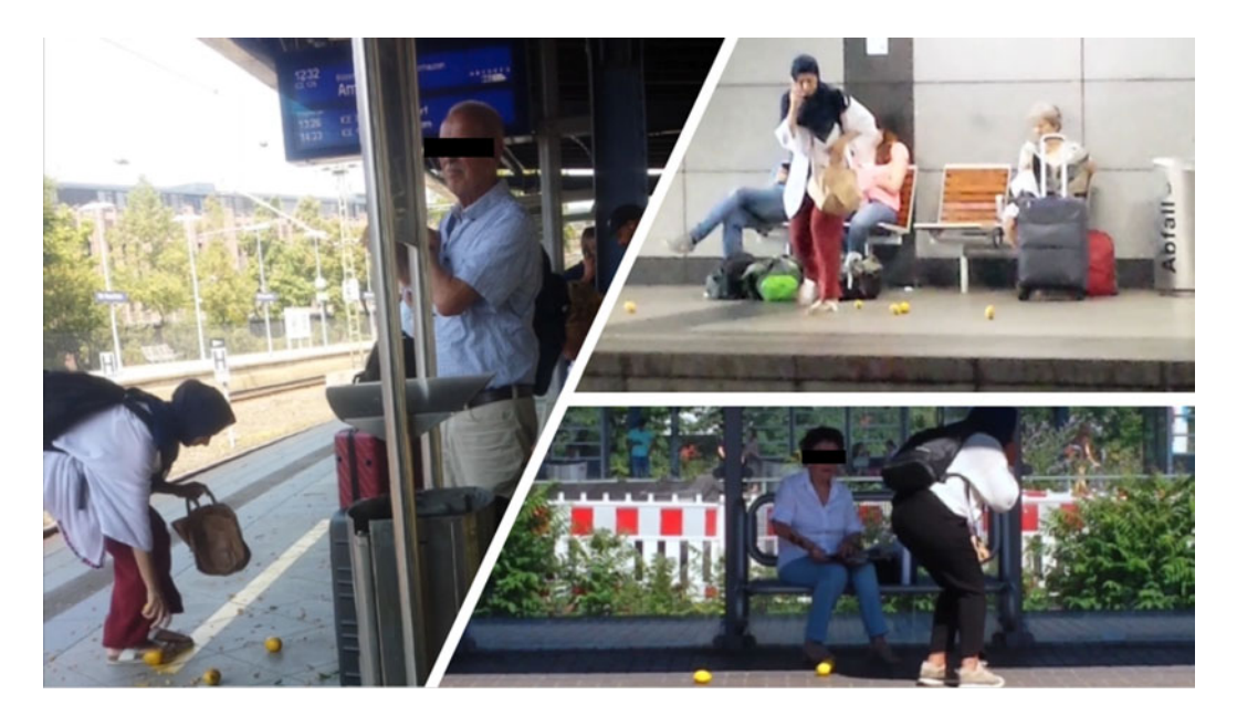
Figure 1. Experiment in action.

helping behavior toward ingroup and outgroup members in an experimental design that is itself a measurement strategy focused on identifying the effect of temperature on behavior while abstracting from other possible causes of discrimination.